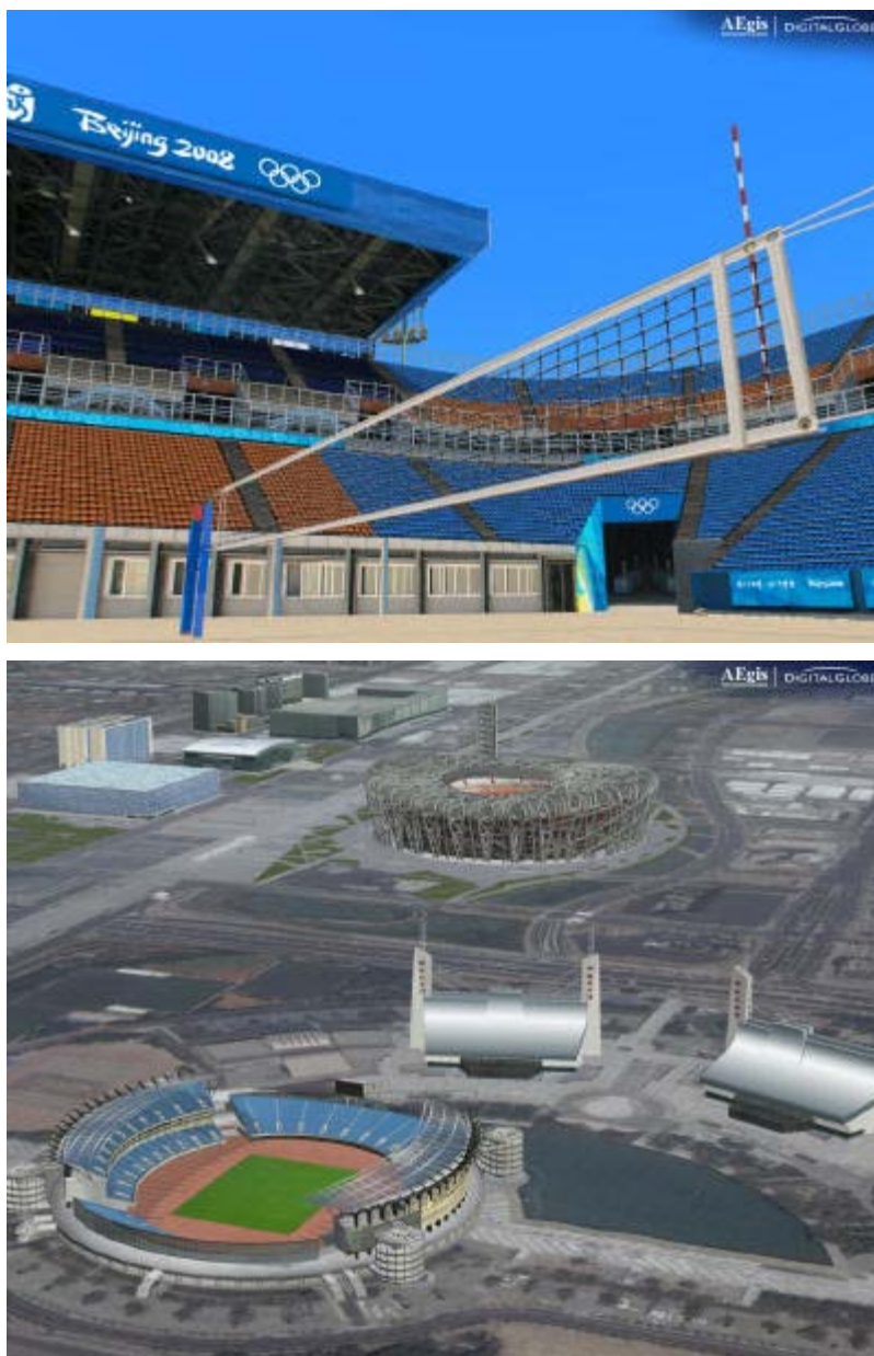
Figure 2. (Click individual image for larger image.)

The dataset is a geospatially referenced model that can be exported as a shapefile for use in ESRI's ArcGIS or as KML for use in Google Earth. AEGis uses an off-the-shelf viewer called LightINT, which it provided to NBC, that is able to determine building height, line of sight, or "as the crow flies" distance in real-time. For example, the Olympic Stadium or "Bird's Nest" is rendered in such detail as to allow the user to pick any seat in the stadium and calculate its line of site and its corresponding 3D (volumetric) view. In addition, if the user of AEGis' viewer removes the texture of the stadium, he will be able to see the building superstructure, similar to what you would see in a typical CAD drawing. But no CAD drawings were used by AEGis; the superstructure was rendered strictly with the datasets it had on hand. According to Scott Allman, director of geospatial programs for AEGis, all models were created simply using the TIN, imagery and ground-based digital photos.