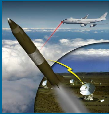
Temperature and Irradiance Sensor Matrix (TISM) – Direct measurement of laser irradiance and target temperature; AEGis is designing and testing the sensor mesh.

Founded in 1989, the AEGis Technologies Group is the world's leading provider of modeling and simulation (M&S) products and services in the areas of Simulation Systems; Geospatial Programs; Warfighter Exercise Support; Systems Engineering and Analysis; Verification, Validation, and Accreditation (VV&A); Test and Evaluation; M&S Training; Simulation Products; and Microsystems and Nanotechnology. AEGis has enjoyed steady growth with revenues increasing to $33 million in sales and average employment growth of 20% per year to their current employment of 185+ professionals nationwide.