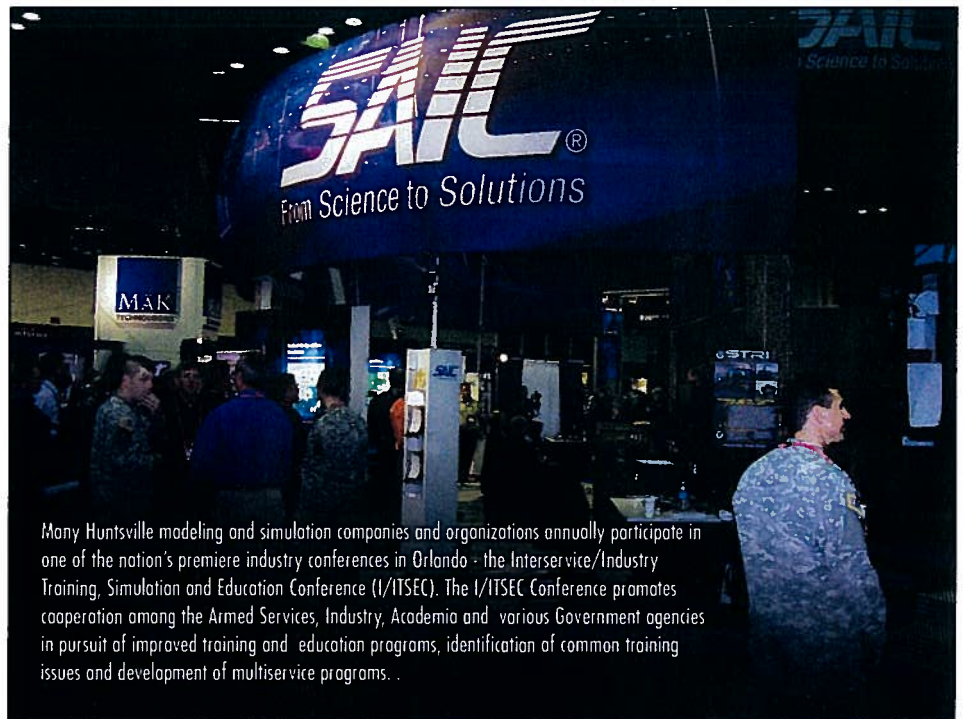
Many Huntsville modeling and simulation companies and organizations annually participate in one of the nation's premiere industry conferences in Orlando - the Interservice/Industry Training, Simulation and Education Conference (I/ITSEC). The I/ITSEC Conference promotes cooperation among the Armed Services, Industry, Academia and various Government agencies in pursuit of improved training and education programs, identification of common training issues and development of multiservice programs.

Outside of UAH, the continued growth in the M&S industry led to the creation of the Alabama Modeling and Simulation